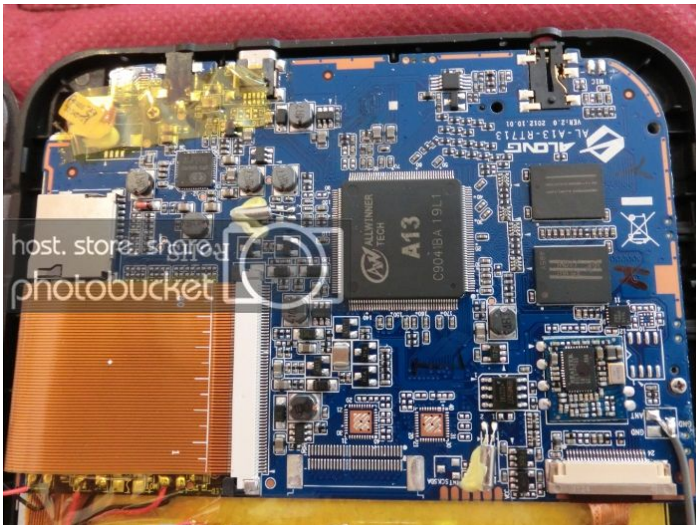
high definition picture

I'm not 100% sure but on this side I think we can see the A13 SOC, the AXP209 lipo battery