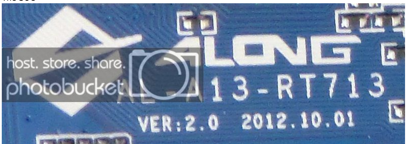
The board label