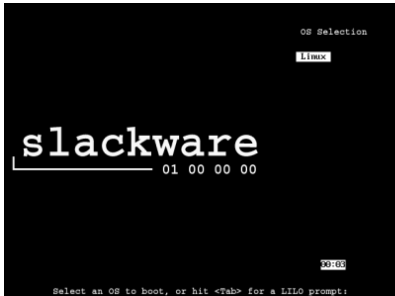
Image 1.: Hit the Tab key on the Lilo Menu before the counter times out.