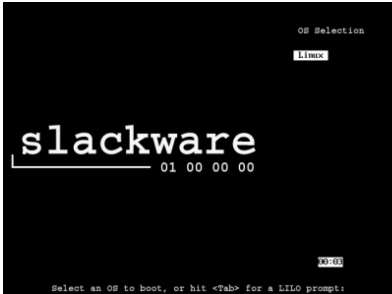
Image 1.: Hit the Tab key on the Lilo Menu before the counter times out.