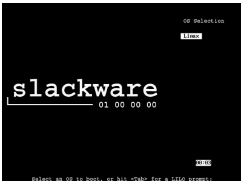
Image 1.: Hit the Tab key on the Lilo Menu before the counter times out.

Then, to boot in runit, reboot and enter init=/sbin/runit-init in the Lilo prompt. To do this, hit the tab key when you are presented with the Lilo menu as shown in Images 1 and 2 below.