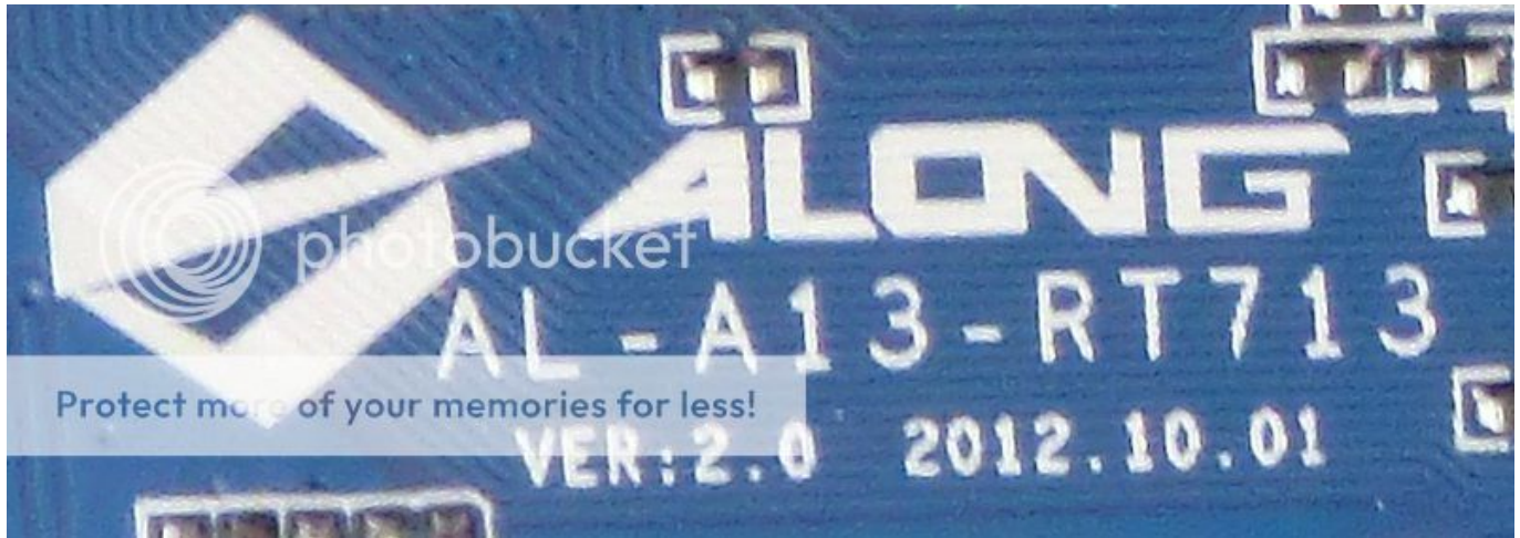
The board label